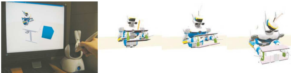
Figure 3. Screenshots of HRP-2 handling an object and being manipulated by a user.

In this simulation once the robot has taken the object there are 40 contact points. As simulations slow down when the number of contact points increases, one step takes around 5.2ms, thus, not allowing real-time interaction. However, we are working on improving this aspect by optimizing the number of contact points and computing the resulting forces per body rather than forces per contact point.